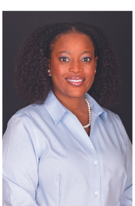
Capture your professional image with us: Corporate • Bio • Passport • Social Media • Dating • PR Etc.

35 Nutmeg Drive, Suite IIO, Trumbull, CT 066II inkphotostudio.com