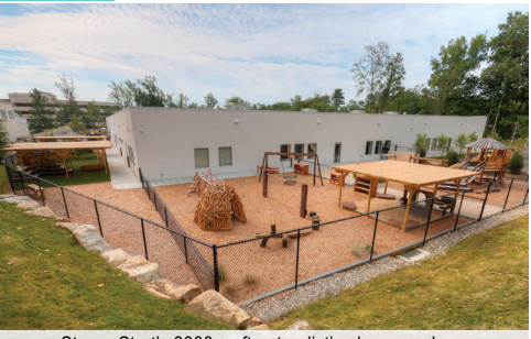
Strong Start's 8000 sq ft naturalistic playground

The second Strong Start is located at 901 Bridgeport Avenue, built by RD Scinto, and offers brand-new facilities for its educational